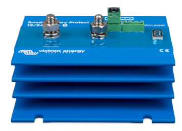
Smart BatteryProtect BP-220